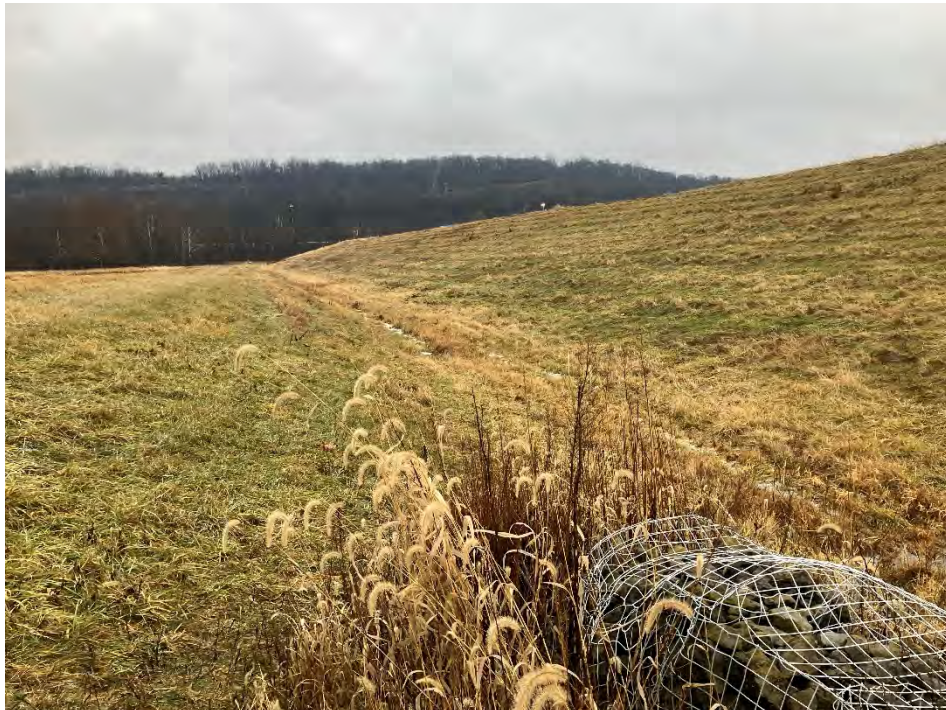
Photograph 22: North non-contact stormwater channel is clear of obstructions. North final cover lower slope is well vegetated and mowed annually. No evidence of animal burrows, erosion, or stability issues.