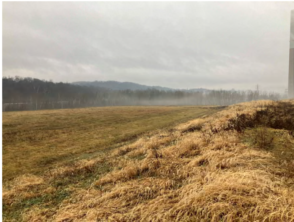
Photograph 1: Stage 6 final cover is well vegetated and mowed annually. No evidence of animal burrows, erosion, or stability issues.