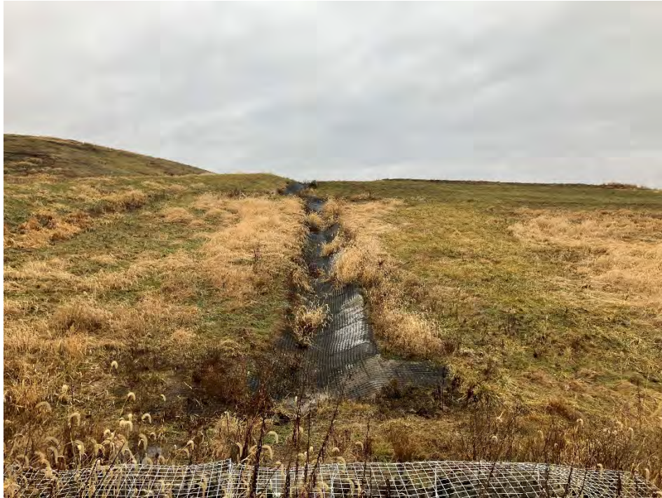
Photograph 27: Non-contact stormwater downchute on south slope is clear of obstructions. Gabion energy dissipator is installed at the junction with the stormwater (non-contact water) perimeter ditch.