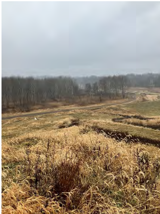
Photograph 4: Downchutes from west side of Stage 4 and Stage 5. No evidence of animal burrows, erosion, or stability issues.