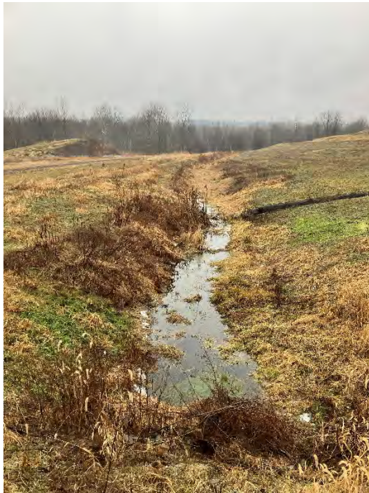
Photograph 12: Non-contact stormwater channel on south slope is clear of obstructions. The final cover south slope is well vegetated and mowed annually. No evidence of animal burrows, erosion, or stability issues.