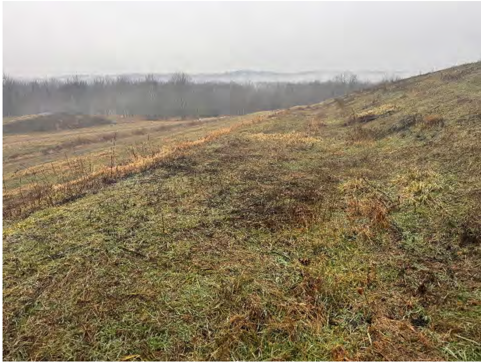
Photograph 19: Stage 4 southern face.