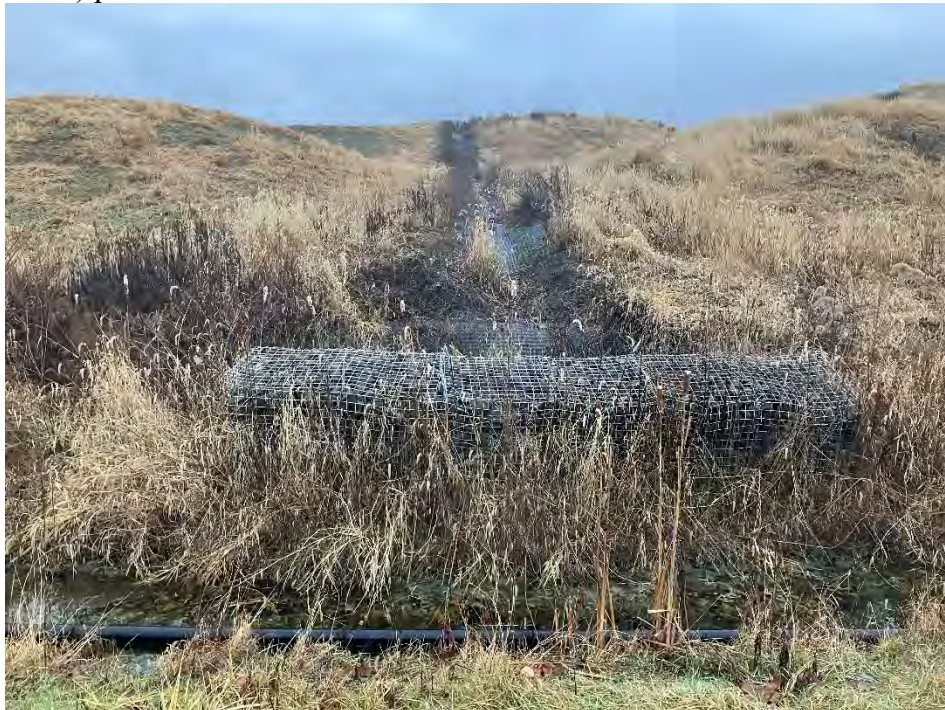
Photograph 28: Non-contact stormwater downchute on west slope is clear of obstructions. Gabion energy dissipator is installed at base of downchute before the stormwater perimeter ditch.