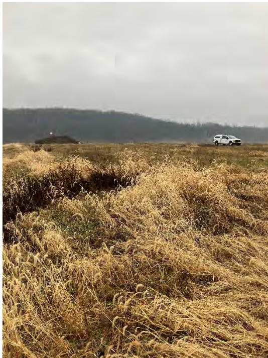
Photograph 5: Stage 4 west slope is well vegetated and mowed annually. No evidence of animal burrows, erosion, or stability issues.