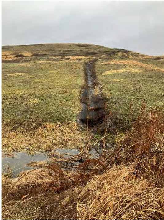
Photograph 11: Non-contact stormwater downchute on south slope is clear of obstructions. Gabion energy dissipator is installed at the junction with the stormwater (non-contact water) perimeter ditch.