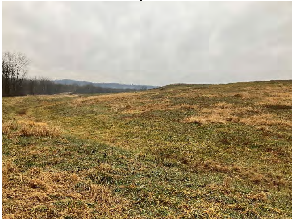
Photograph 26: South non-contact stormwater channel looking west is clear of obstructions. South final cover lower slope is well vegetated and mowed annually. No evidence of animal burrows, erosion, or stability issues.