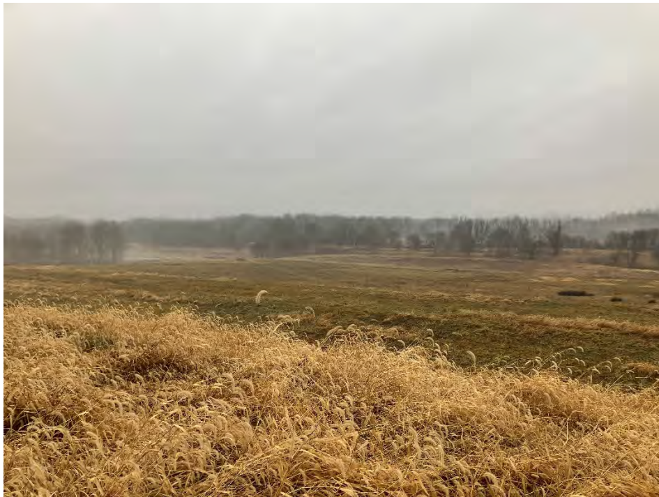
Photograph 3: Stage 5 final cover is well vegetated and mowed annually. No evidence of animal burrows, erosion, or stability issues.