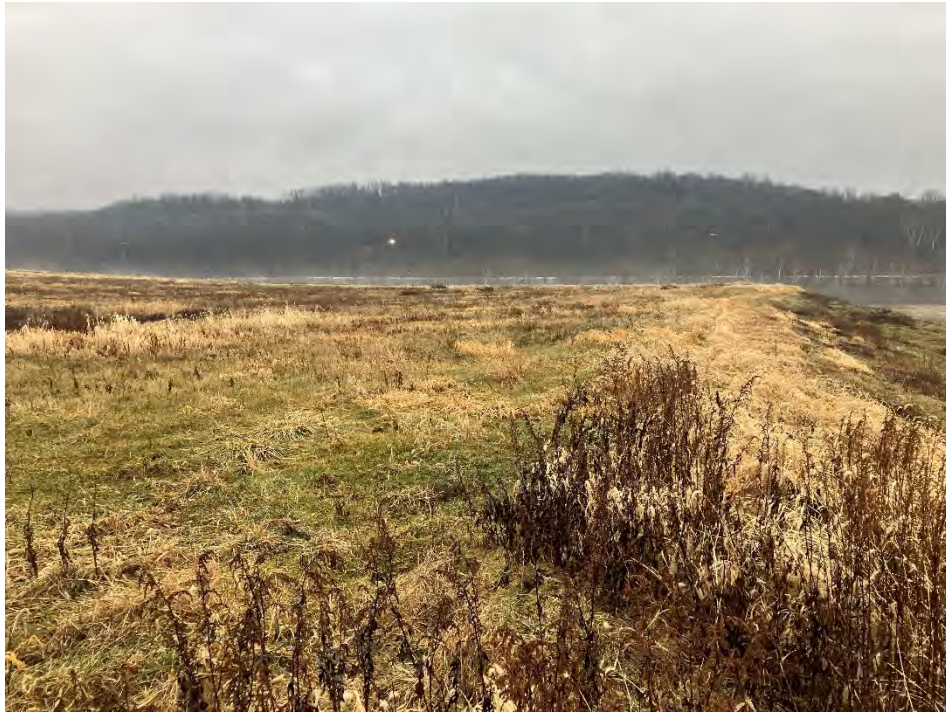
Photograph 7: Stage 4 south slope is well vegetated and mowed annually. No evidence of animal burrows, erosion, or stability issues.