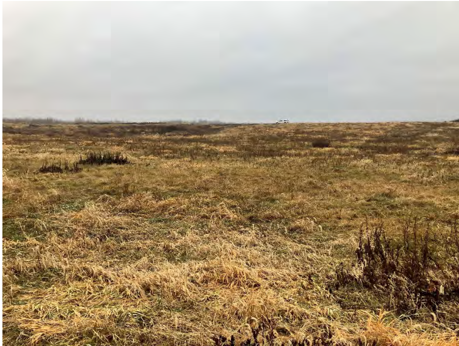
Photograph 8: Intermediate cover in Stage 4 active area looking northwest is well vegetated and mowed annually.