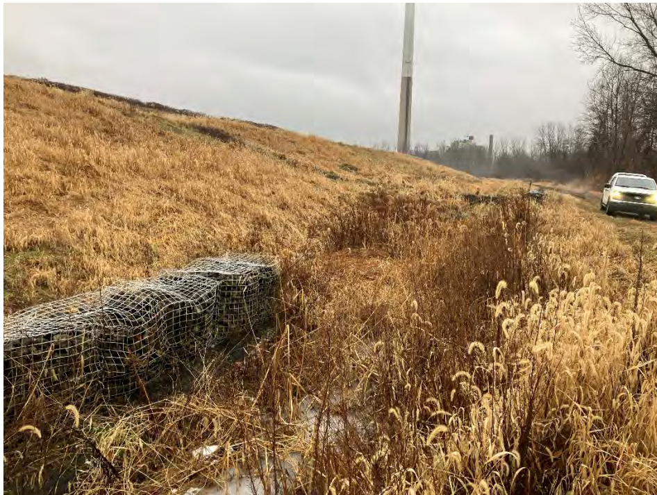
Photograph 15: West non-contact stormwater channel looking south is clear of obstructions. West final cover lower slope is well vegetated and mowed annually. No evidence of animal burrows, erosion, or stability issues.