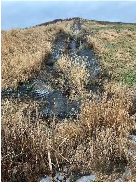
Photograph 13: Non-contact stormwater downchute in southwest corner is clear of obstructions. Gabion energy dissipator is installed at junction with the stormwater perimeter ditch.