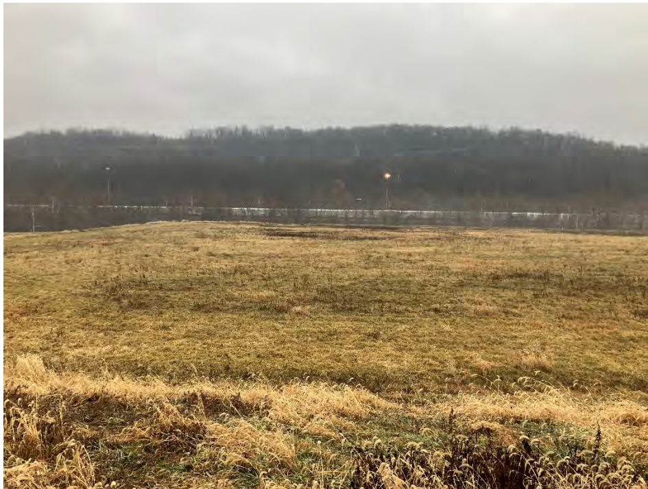
Photograph 2: Stage 5/Stage 6 final cover is well vegetated and mowed annually. No evidence of animal burrows, erosion, or stability issues.