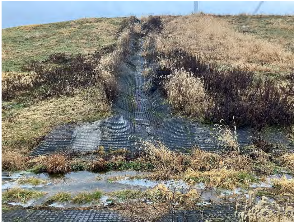
Photograph 23: Non-contact stormwater downchute in northeast corner is clear of obstructions. Gabion energy dissipator is installed at the junction with the stormwater (non-contact water) perimeter ditch.