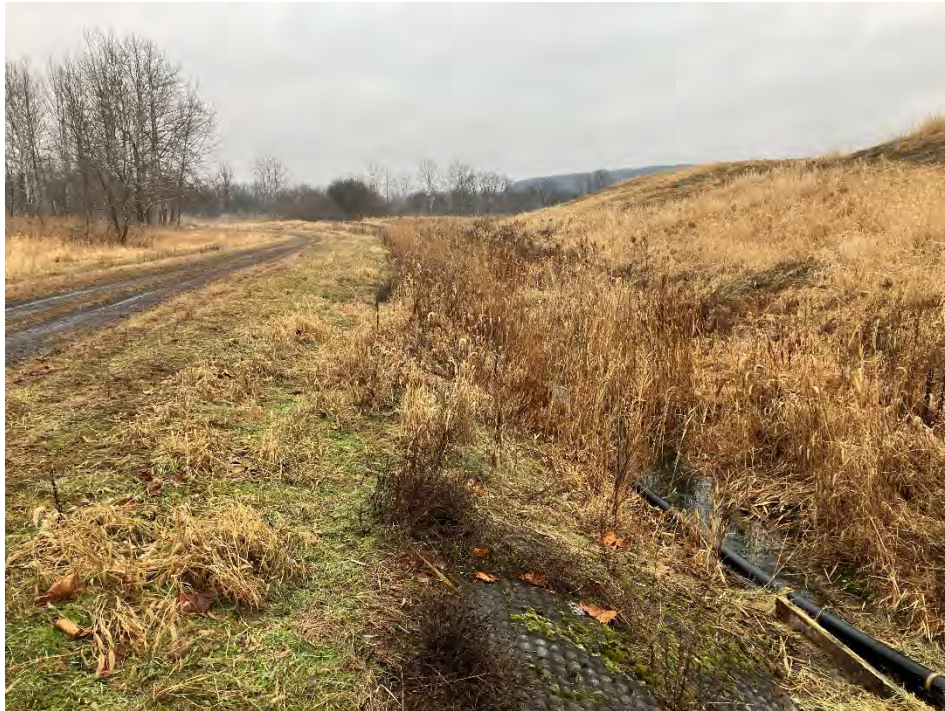
Photograph 17: West non-contact stormwater channel looking north is clear of obstructions. West final cover lower slope is well vegetated and mowed annually. No evidence of animal burrows, erosion, or stability issues.