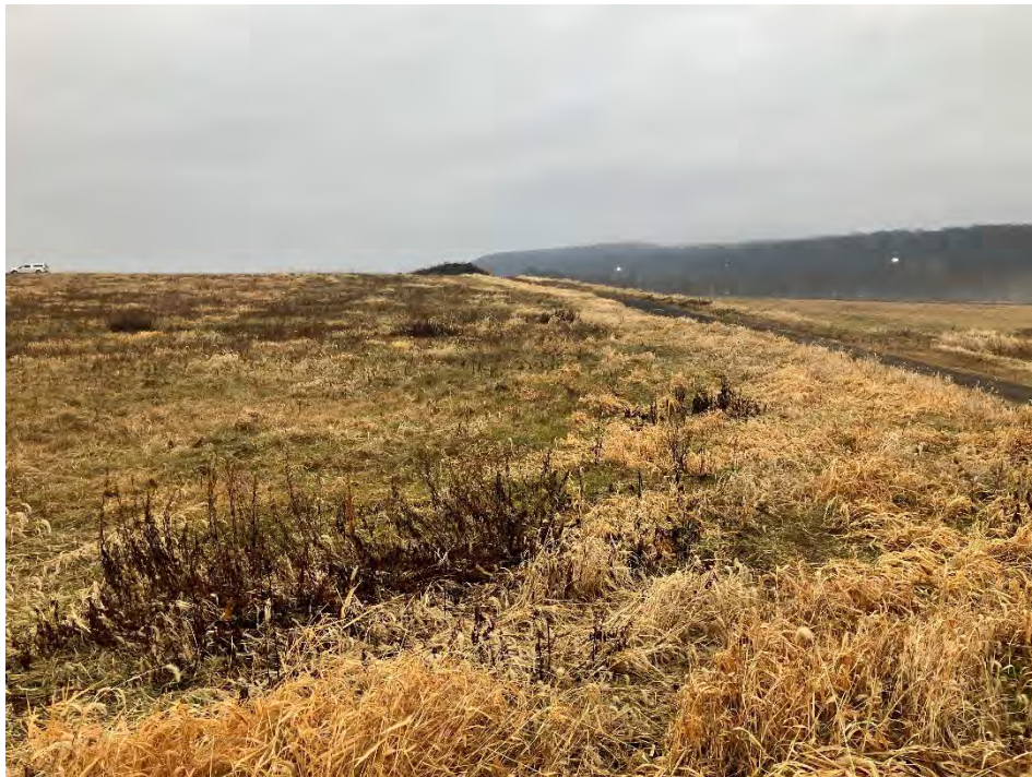
Photograph 10: Intermediate cover area in Stage 4 active area /Stage 6 final cover is well vegetated and mowed annually.