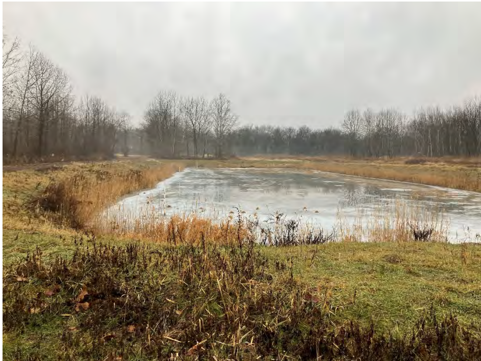
Photograph 18: Leachate (contact water) Pond. No evidence of animal burrows or liner damage.