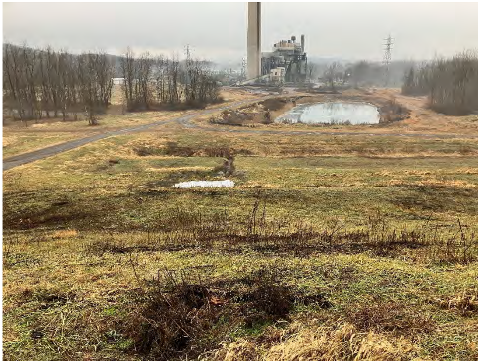
Photograph 9: Stage 4 south slope is well vegetated and mowed annually. No evidence of animal burrows, erosion, or stability issues.