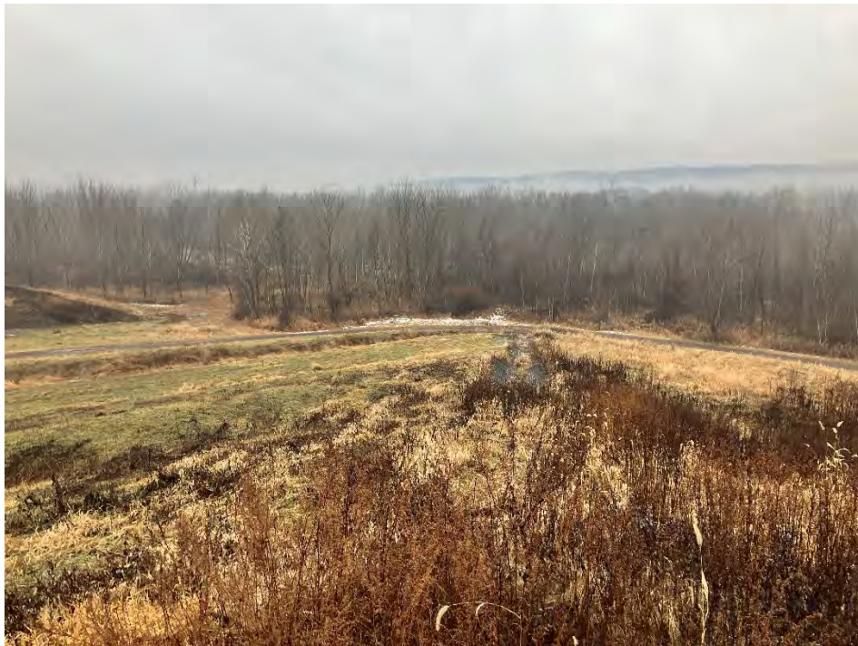
Photograph 6: Stage 4 southwest corner slope and downchute is well vegetated and mowed annually. No evidence of animal burrows, erosion, or stability issues.