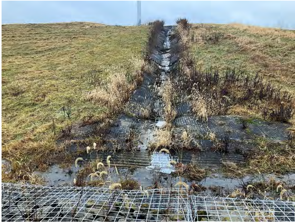
Photograph 21: Non-contact stormwater downchute in northwest corner is clear of obstructions. Gabion energy dissipator is installed at the junction with the stormwater (non-contact water) perimeter ditch.