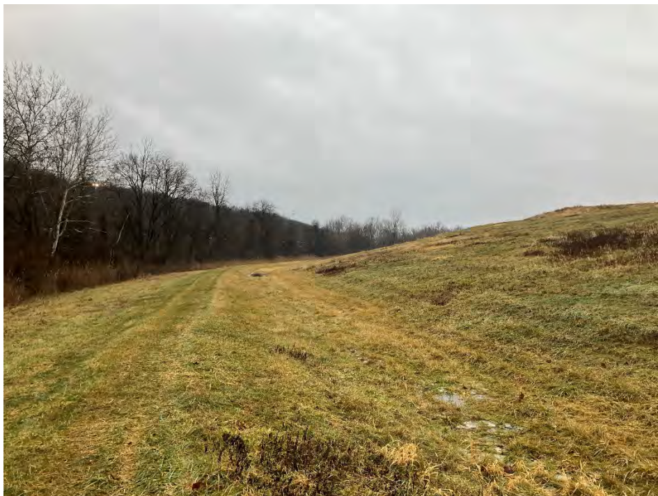
Photograph 24: East non-contact stormwater channel looking south is clear of obstructions. East final cover lower slope is well vegetated and mowed annually. No evidence of animal burrows, erosion, or stability issues.