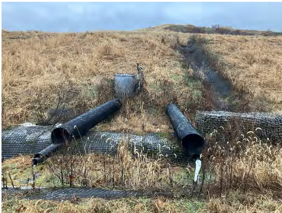
Photograph 16: Leachate collection zone and leak detection zone discharge pipes.