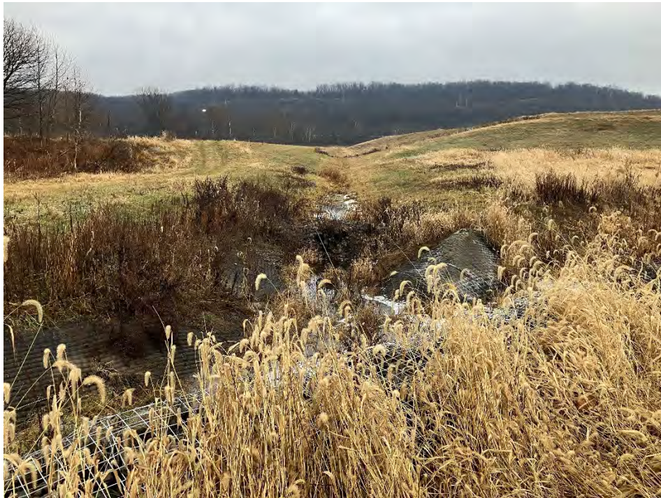
Photograph 20: North non-contact stormwater channel is clear of obstructions. North final cover lower slope is well vegetated and mowed annually. No evidence of animal burrows, erosion, or stability issues.