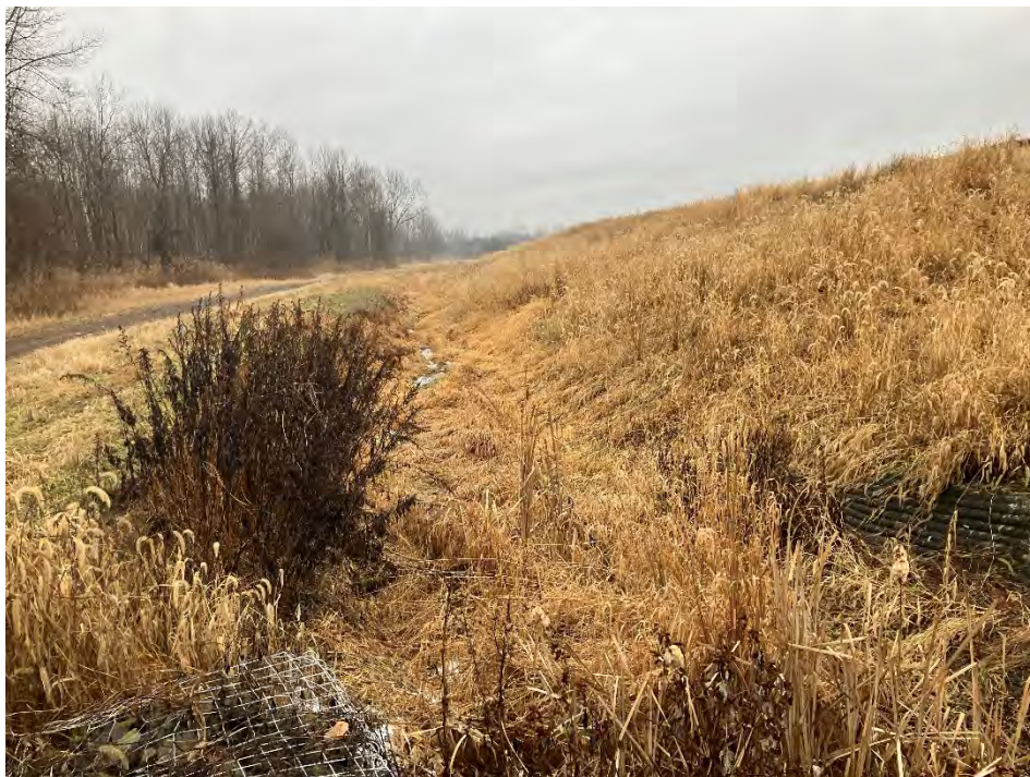
Photograph 14: West non-contact stormwater channel looking north is clear of obstructions. West final cover lower slope is well vegetated and mowed annually. No evidence of animal burrows, erosion, or stability issues.