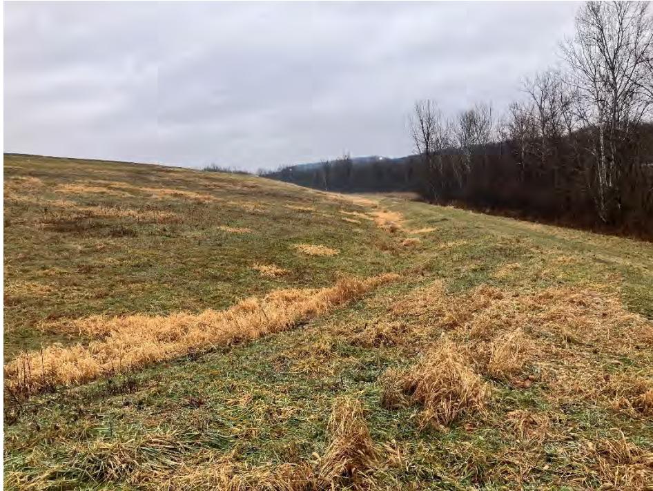
Photograph 25: East non-contact stormwater channel looking north is clear of obstructions. East final cover lower slope is well vegetated and mowed annually. No evidence of animal burrows, erosion, or stability issues.